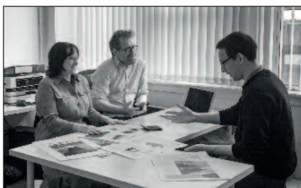
The founders discuss the Scottish Catholic