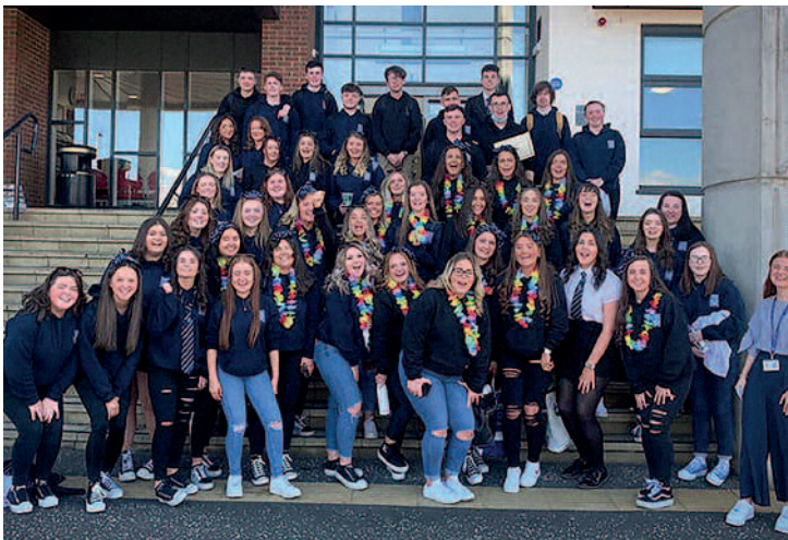
Notre Dame pupils

Young people from all over Scotland took part in the awards, which were introduced in 2011, as part of a legacy of the UK visit of Pope Benedict XVI in September 2010, and asks young people to use their Faith as a starting point for reflection, leading to actions which show witness. Participants in the Caritas Award are supported in deciding how they can develop and use their gifts in a way that witnesses to God’s love (“Caritas”) in their communities.